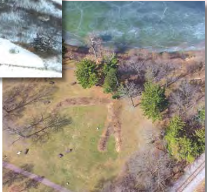
Many Indian mounds at Devil's Lake State Park, near Baraboo, were damaged then reconstructed.

LLC, and president of the Wisconsin Archaeological Society, maintains the Effigy Mounds Initiative Facebook page, which he started to share his “lifelong love affair with mounds.” He said the site “very quickly and shockingly” became a focal point of mobilization against the pro-