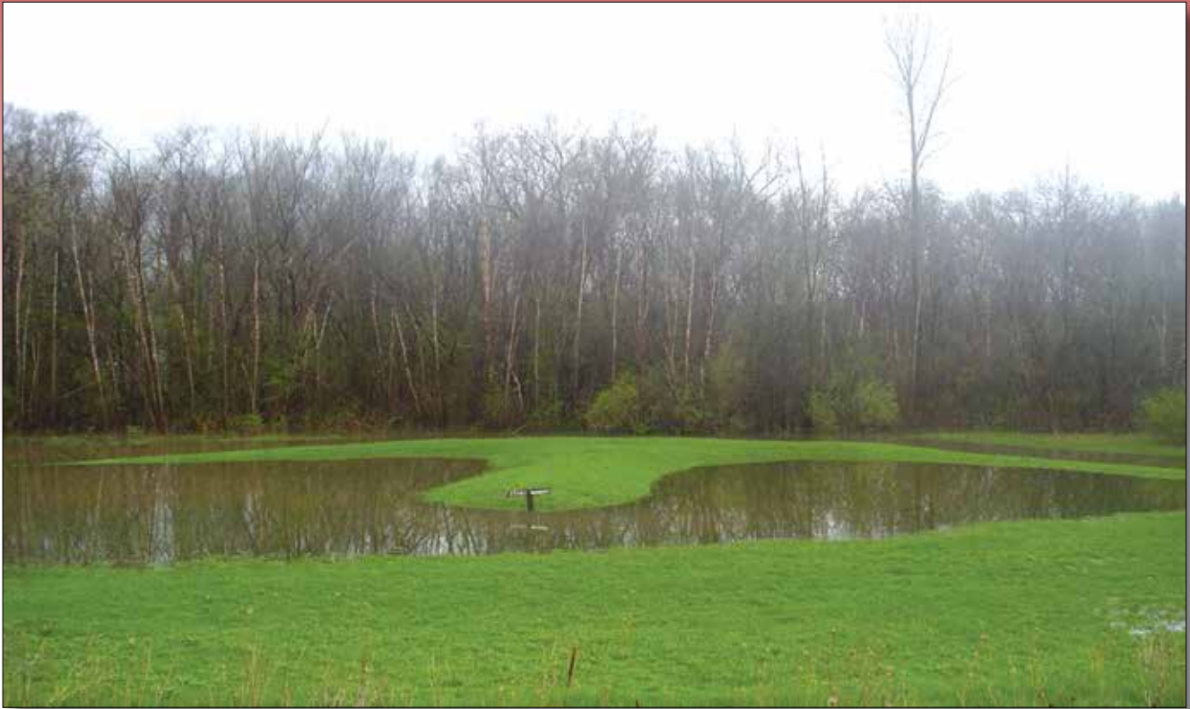
This bird mound, which can be seen on the south side of Highway 60 west of Muscoda, is outlined by high water from the Wisconsin River. (Mark Culp) Opposite page: Frank's Hill is across the river from Muscoda, Wis. (Mark Culp)

units and stayed warm in rock shelters, hunting deer, making tools, telling stories and consuming the stores of summer's surplus.