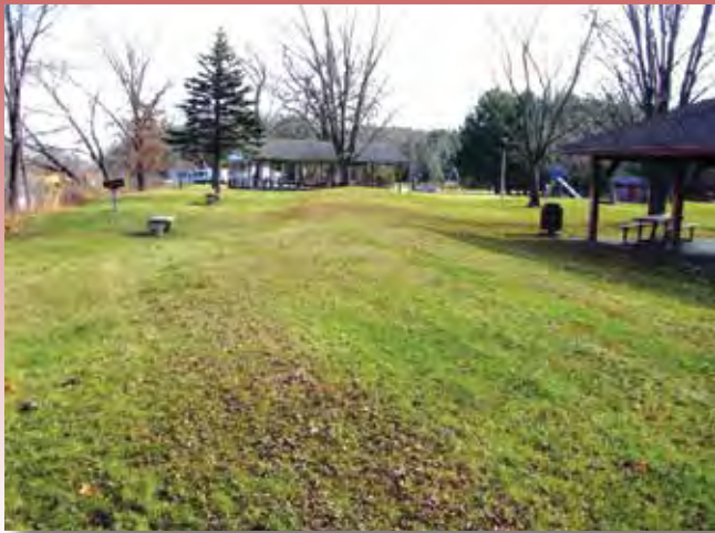
Mounds and a playground share a city park in Avoca, Wis.