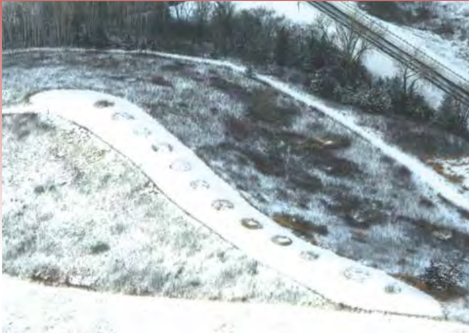
These conical mounds are part of the Shadewald Mound Group near Frank's Hill.