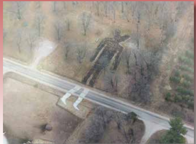
The only man mound in the state was cut off at the knees by a highway near Baraboo, Wis. (Kurt Sampson)

stunning views of the surrounding hills and fields. It's easy to see why people marked this as a sacred space. The hill is mowed, except for the mounds, so they are easily seen. The mounds are as large as 100 feet across and about three feet high. In July, the effigy mounds are covered with Queen Anne's lace, grasses and wildflowers.