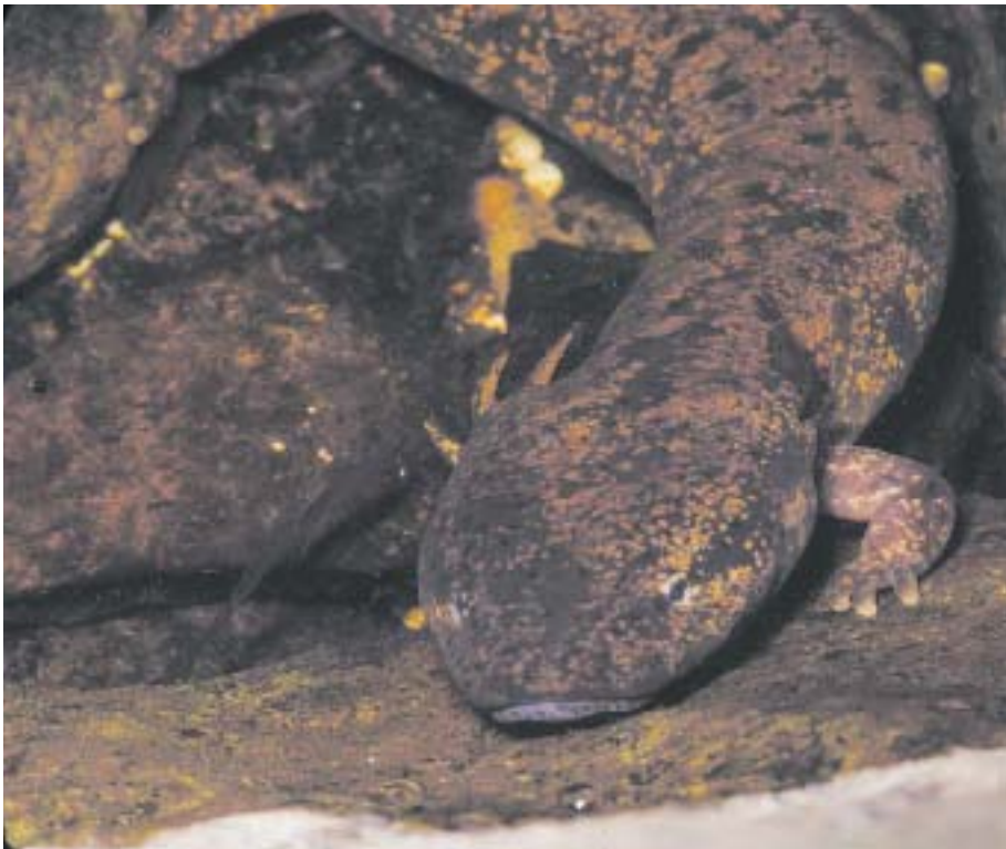
You can see the small, compact gills on this mudpuppy living in a fast, clear stream.

unique, because all other known hosts for mussels are fish. Mussels begin life as larvae, called glochidia, that cannot swim and are just carried by the water or sink to the bottom. A glochidium has two valves, or halves, that are partly open and capable of