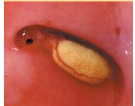
A mudpuppy embryo will take several years to reach adulthood. This one is from an egg that was accidentally torn during removal from a rock.