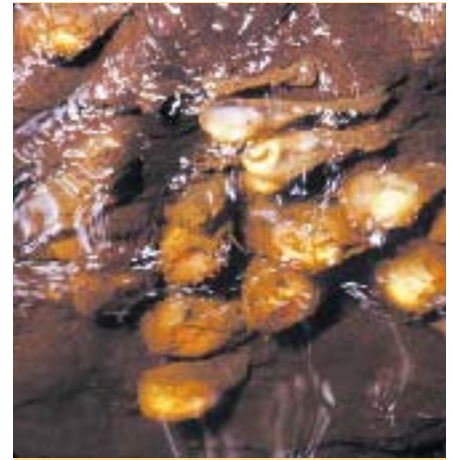
Mudpuppy eggs hang from the underside of a rock.

Along the Upper Mississippi River and eastward, the common mudpuppy is the host for the larva of a freshwater mussel called the salamander mussel, Simpsonaias ambigua . This is