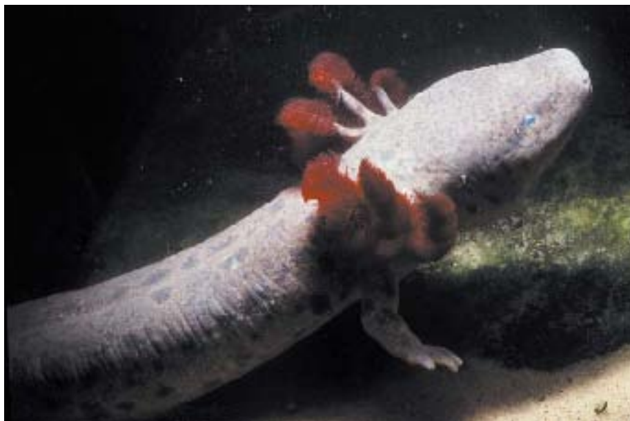
Above: Mudpuppies can swim, but mostly they walk along the bottom.

The common mudpuppy, Necturus maculosus maculosus , is an amphibian whose range extends from southeast Manitoba to southern Quebec, down to southern Missouri and northern Georgia. In the Mississippi River mudpuppies are found from Missouri upriver to St. Anthony Falls, which blocks its upstream progress. In the Arkansas River drainage system in the South, Necturus maculosus