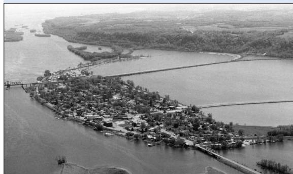
Top: North Riverfront Park at Bellevue, Iowa.

For more information on the Grand Excursion 2004, call (513) 381-6700. Also see the Big River website for links. Grand Excursion 2004 recently opened an office in the Quad Cities at 2021 River Dr., Moline, IL 61265-1472, (309) 736-3678.