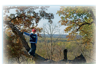
Casper Bluff Land and Water Preserve (Jo Daviess Conservation Foundation)