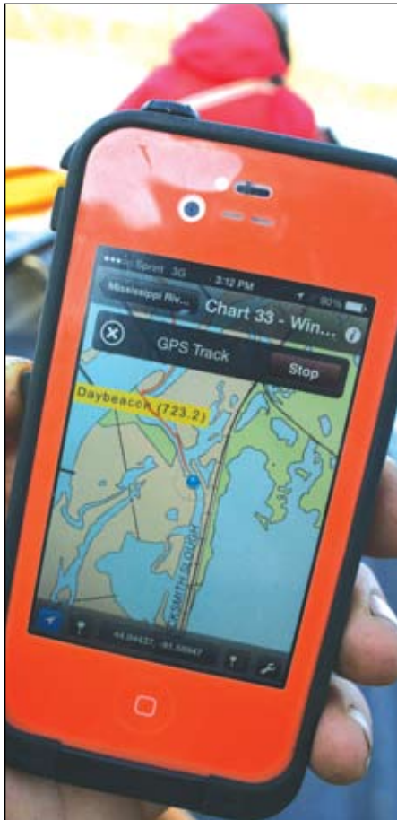
The mobile app PDF Maps uses the Geo-PDF navigation charts to display your current position when you are exploring the river. (Ryan Johnson)

Avenza Systems, to be the primary platform for the new Geo-PDF charts. This app, now available for both iPhone and Android phones, is striving to become the standard application for digital maps. The entire series of 2011 navigation charts can be easily downloaded for free — as well as hundreds of other maps — and used on your smartphone.