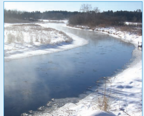
The St. Croix River near its headwaters near Solon Springs, Wis., would have become a straightened and deepened barge canal instead of this meandering stream had the waterway been built.

The silence on the day (except for the squeak of our boots on the packed snow) was appropriate. I walked with a true reverence for this place that, thankfully, has been preserved. Here it is not so much a river as a conifer swamp of mature white cedar, balsam fir and