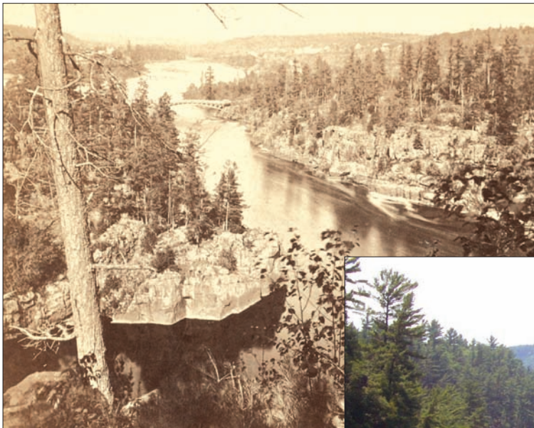
Left: The Dalles of the St. Croix, the L-shaped turn in the St. Croix gorge near St. Croix Falls, Wis., and Taylors Falls, Minn., was a popular subject for stereoscopic images in the late 1800s.